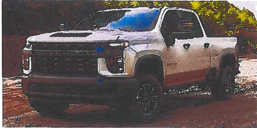
Note:Photo may not represent exact vehicle or selected equipment.

Vehicle: [Fleet] 2023 Chevrolet Silverado 2500HD (CK20943) 4WD Crew Cab 172" Work Truck ( Complete ) ✓