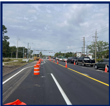
Raising the road, paving, and striping in the area in front of Tom Thumb and CVS.