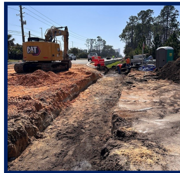
Trench drain has been installed under Dairy Queen driveway.