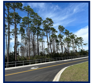
Upgraded sidewalks with railings where necessary.