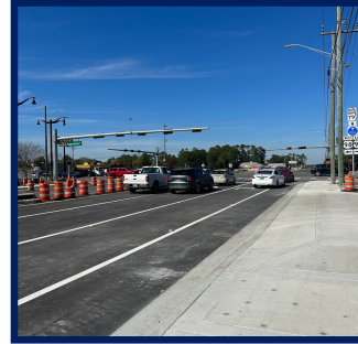
South Arnold Road is now a divided highway.