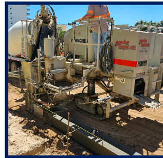
Placing curb in the area of Tidewater Beach Resorts.