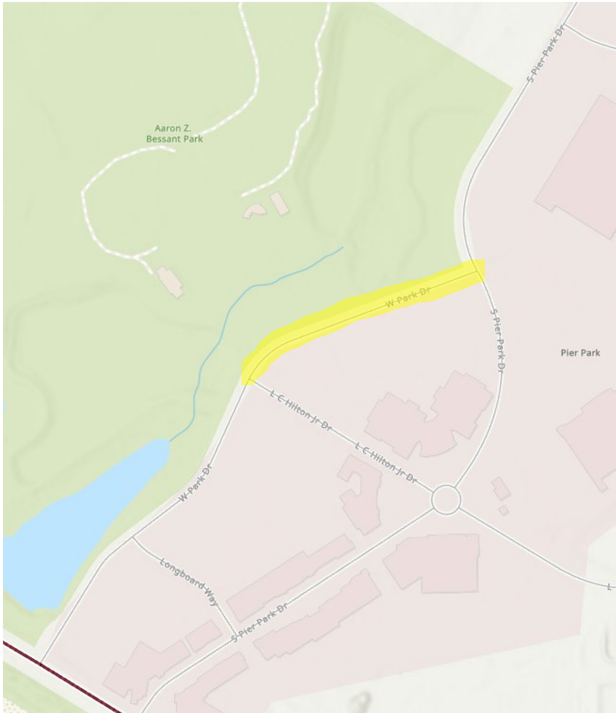
West Park Drive closure between South Pier Park Drive and LC Hilton Jr. Drive