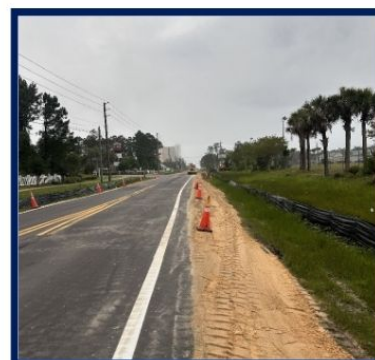
Grading shoulder area to avoid drop offs.