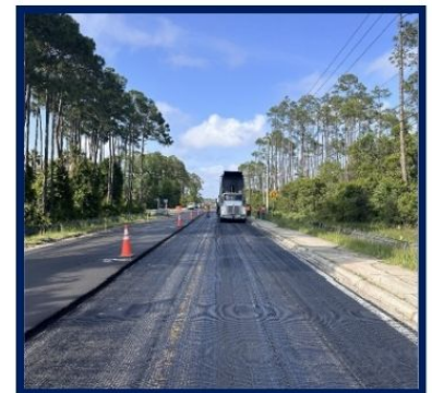
Paving over the geosynthetic mat south of Cabana Boulevard.