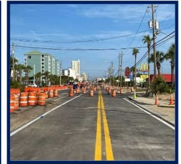
Paving and striping from Lullwater Drive west to the roundabout.