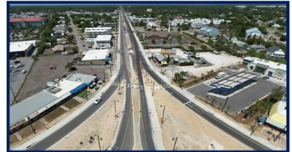
Looking south and north on South Arnold Road May 7.