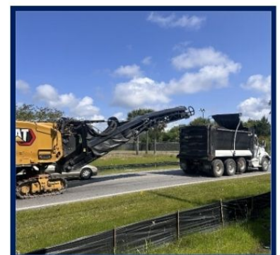
Milling asphalt near iStorage.