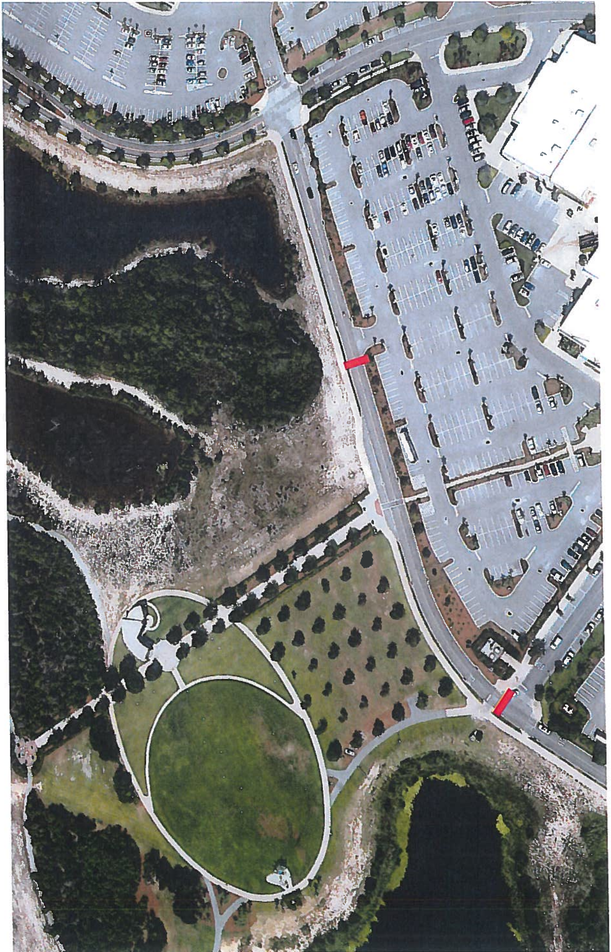
Chasin' The Sun Music Festival